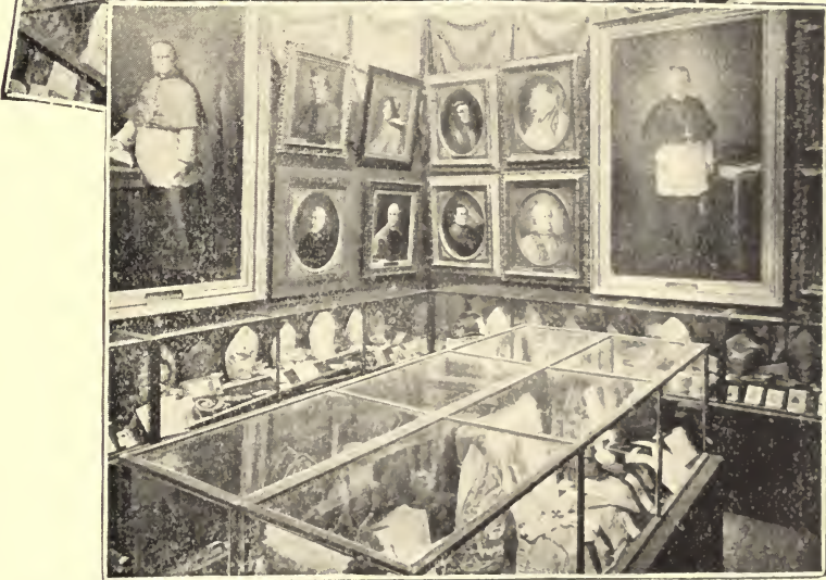
EXHIBIT OF BISHOP'S MEMORIAL HALL, ETC., NOTRE DAME UNIVERSITY, NOTRE DAME, IND.